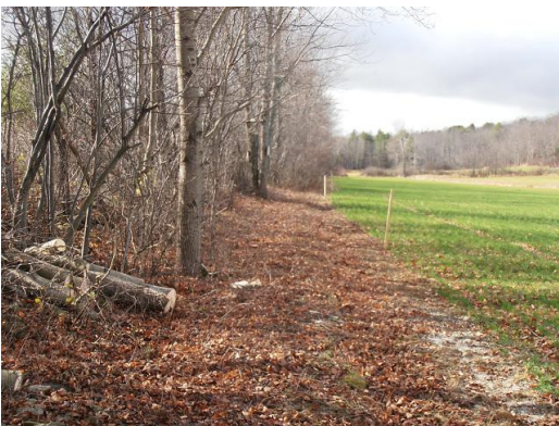
Laudy and Christian cut back the hedgerow in these before (top) and after (bottom) pics. This section of C7B has been moved to the edge of the field due to a freshly planted crops. Stakes have been put up and a rope will connect them.